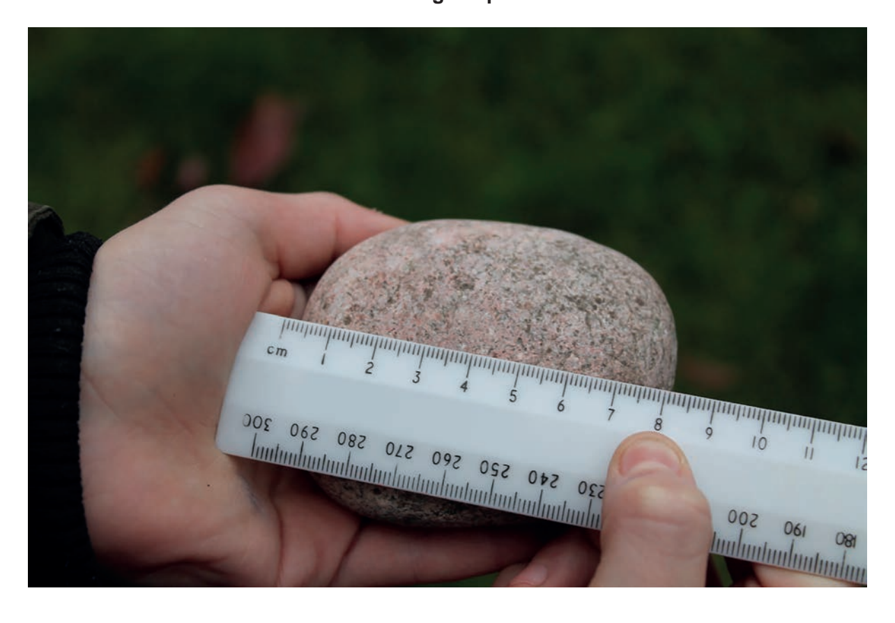
Fig. 2.3 for Question 2 Measuring the pebble